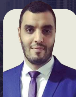
GOV. TRX. MGMT Mohamed El-Tokhy